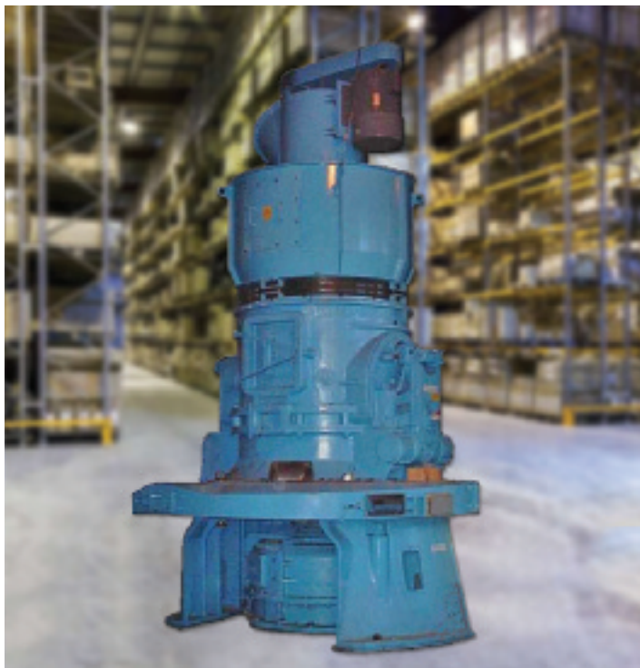
VBC SEPARATOR FITTED TO LOPULCO LM12

The VBC Separator is running successfully in many countries around the world. Bradley support, with full spares and service back-up ensures continuous high performance.