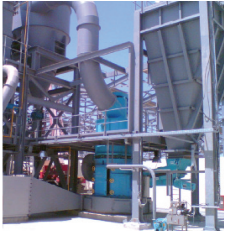
BM 30 MILL FOR LIMESTONE - USA

Since 1886 Bradley Pulverizer Company has served the powder processing industry worldwide.