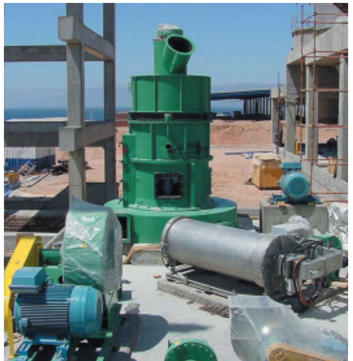
BM 14 MILL - JORDAN

The VBC Separator is running successfully in many countries around the world. Bradley support, with full spares and service back-up ensures continuous high performance.