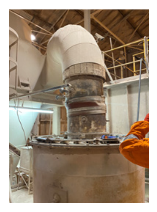
Figure 1: Mill and Classifier BEFORE overhaul. Note the confined workspace.

Increased up-time of the Bradley mill would both improve efficiencies and lower annual production costs.