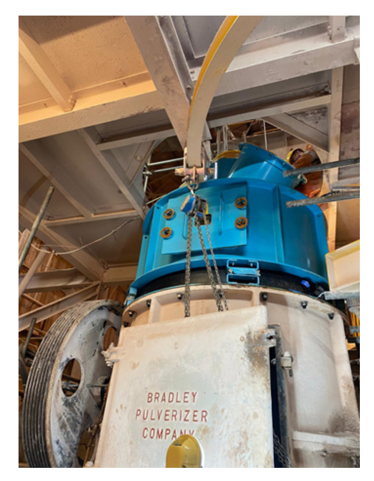
Figure 3: Completed mill overhaul with new VBC

Bradley Pulverizer accomplished a complete on-site mill overhaul and classifier upgrade in a tightly confined space and poor weather conditions, ahead of schedule, in just 17 days! The new vertical blade classifier expanded the range of material grades that the mill can process and increased yields by two-tons (19% increase) per hour. Mill upgrades improved the overall performance and up-time, including better oil retention, fewer work stoppages for maintenance, and lower operating costs.