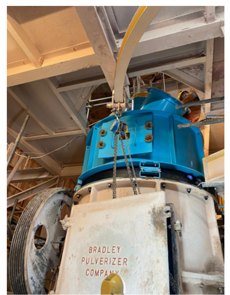
Figure 3: Completed mill overhaul with new VBC

Bradley Pulverizer accomplished a complete onsite mill overhaul and classifier upgrade in a tightly confined space and poor weather conditions, ahead of schedule, in just 17 days! The new vertical blade classifier expanded the range of material grades that the mill can process and increased yields by two-tons (19% increase) per hour. Mill upgrades improved the overall performance and up-time, including better oil retention, fewer work stoppages for maintenance, and lower operating costs.