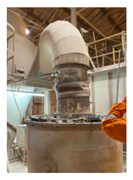
Figure 1: Mill and Classifier BEFORE overhaul. Note the confined workspace.

Increased up-time of the Bradley mill would both improve efficiencies and lower annual production costs.